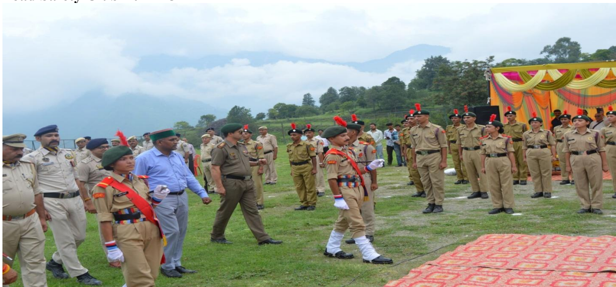
NCC Cadets on Parade during Independence Day Parade-2024