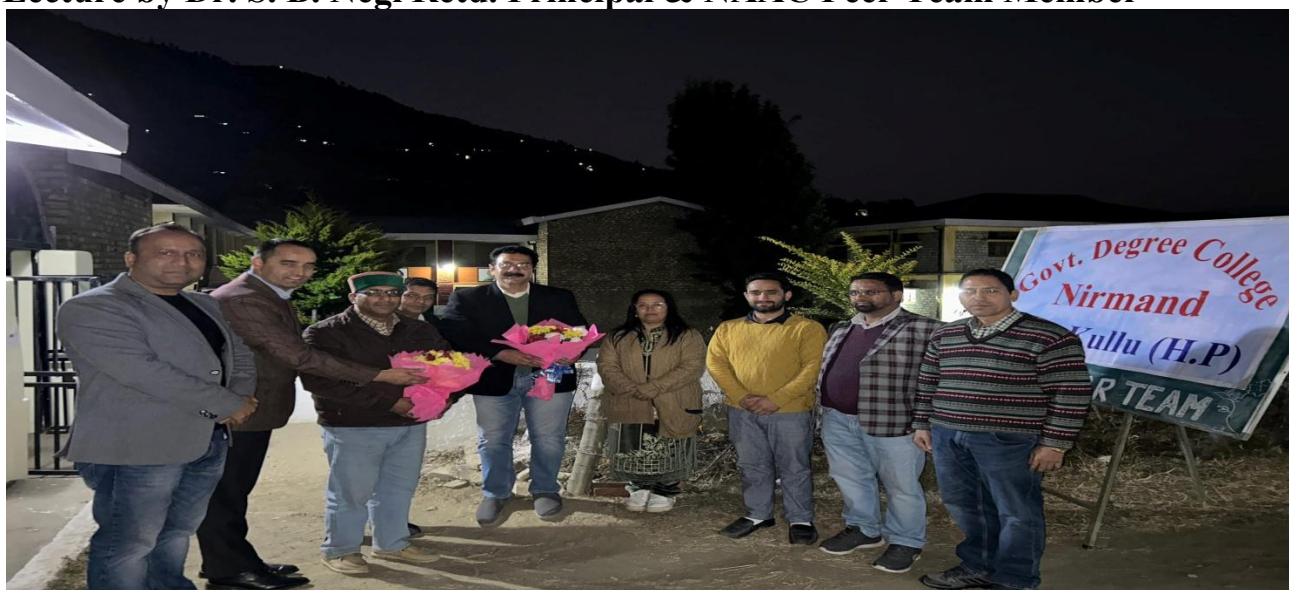
Welcome of SAR Evaluation Team