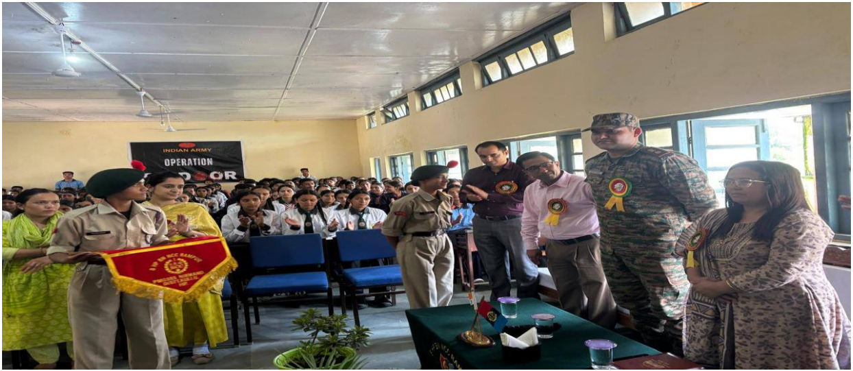
Operation Sindoor briefing organized by Indian Army