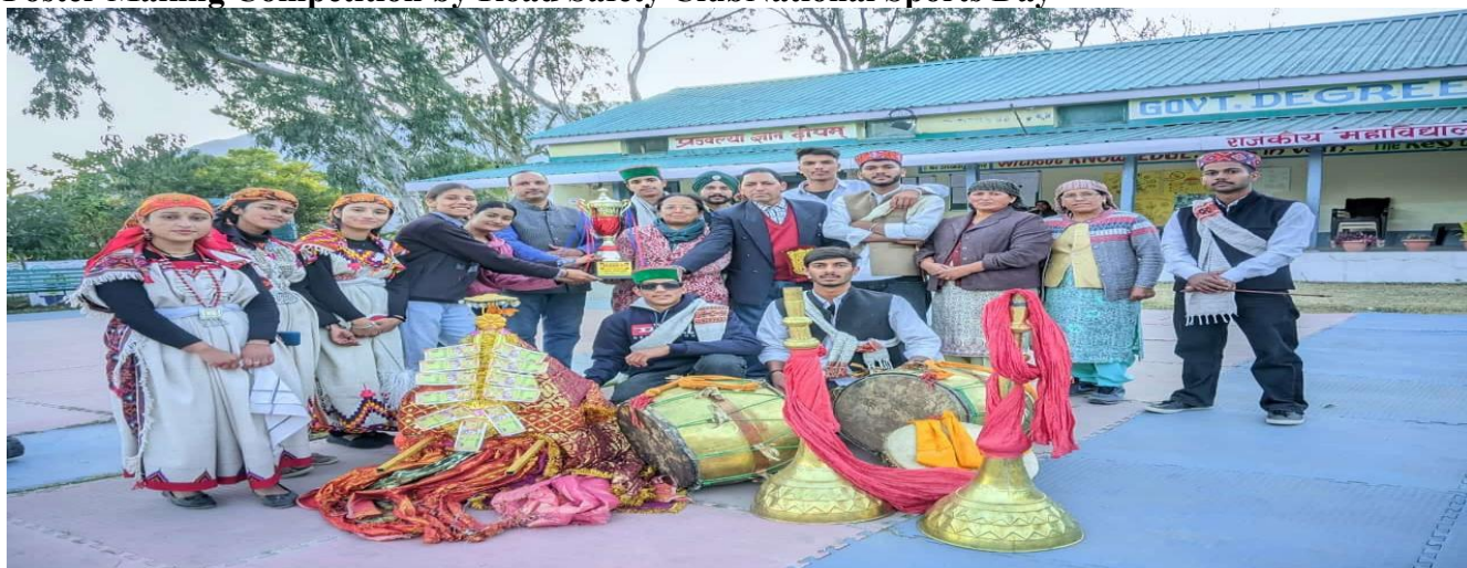
Winners folk dance in Budi Diwali Mela First Position