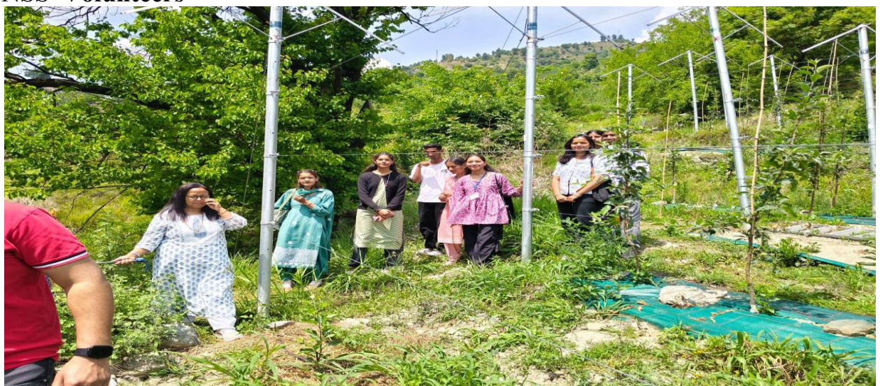
ECA Farm Tour