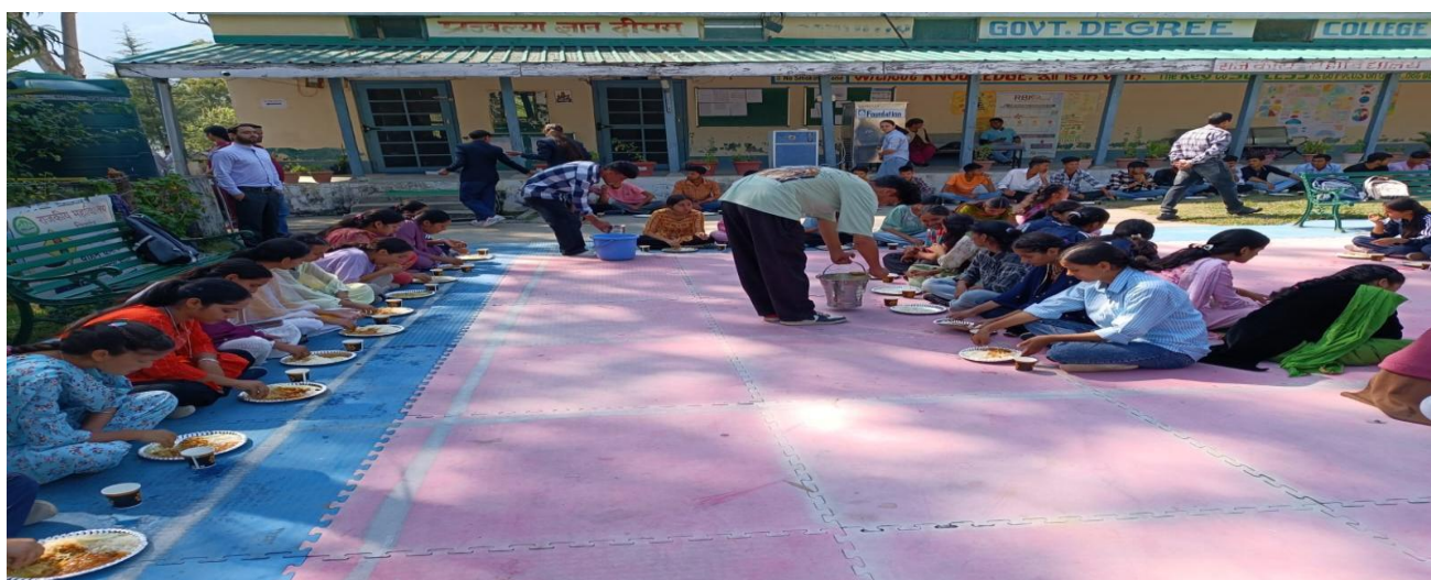
Community Lunch Institution Best Practice