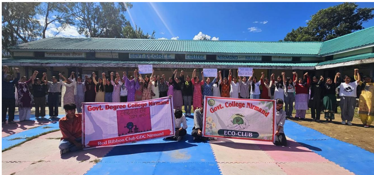
Red Ribbon Club & Eco Club joint venture