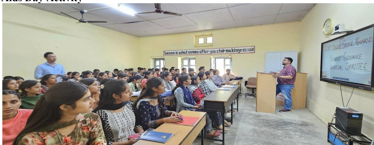
Red Ribbon Club Activity