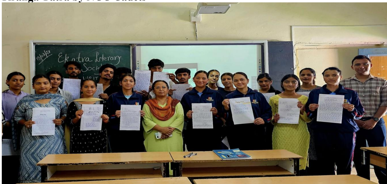
Activity by Ekatra Literary Society