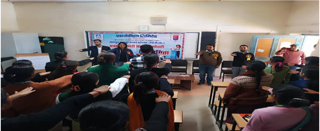
Vigilance awareness week organized by SJVN in the college