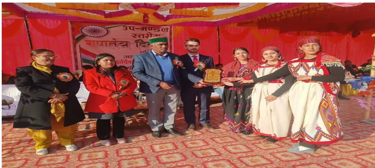
Folk Dance First Prize Independence Day Parade-2024-25