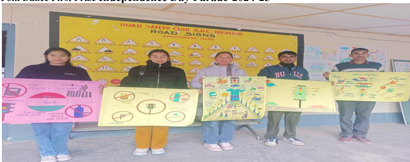
Poster Making Competition by Road Safety Club National Sports Day