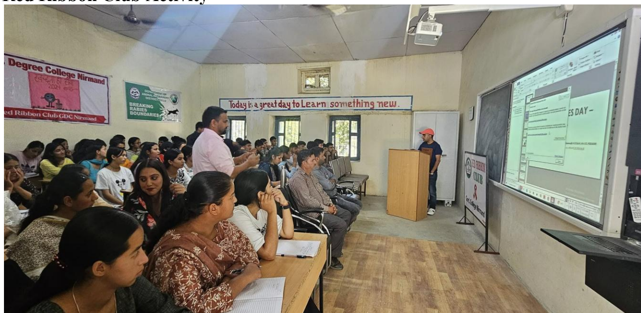
Anti Rabies Day