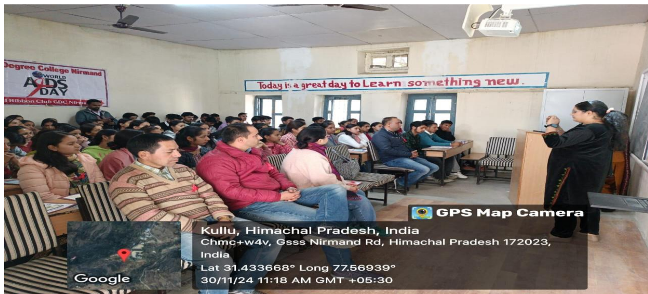
Aids Day Activity