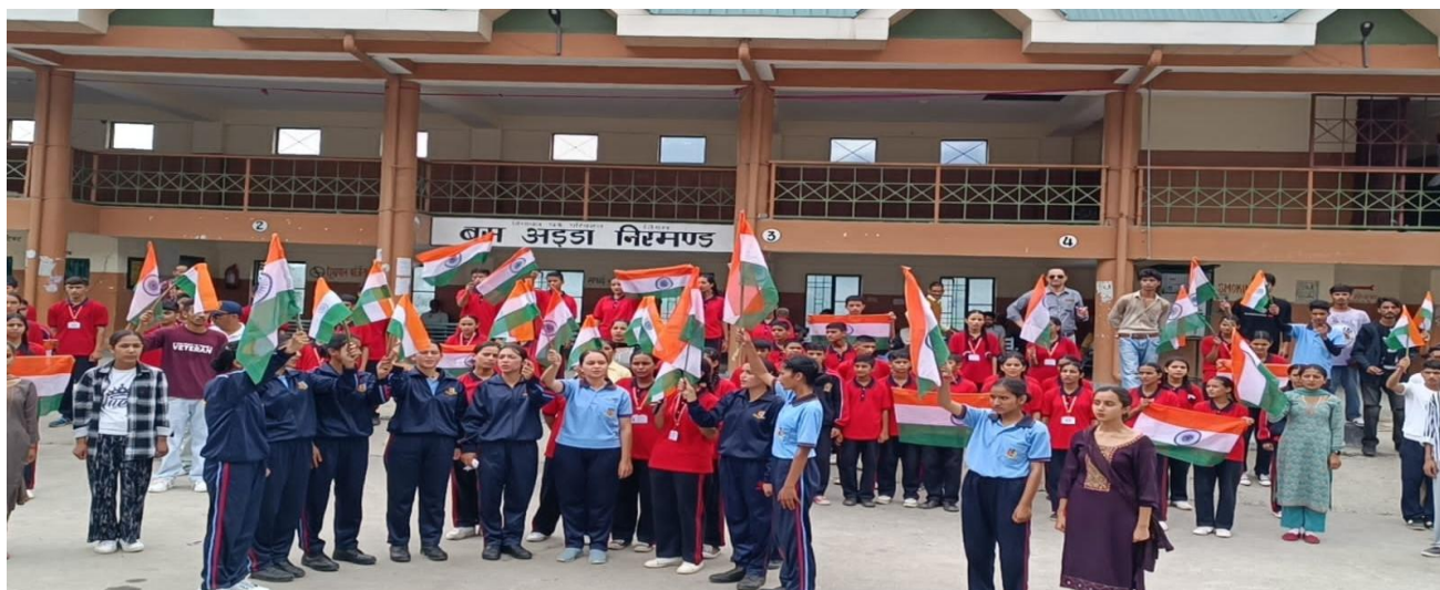
Tiranga Yatra by NCC Cadets