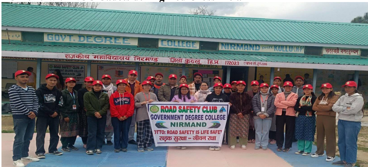
Road Safety Club-2024-25